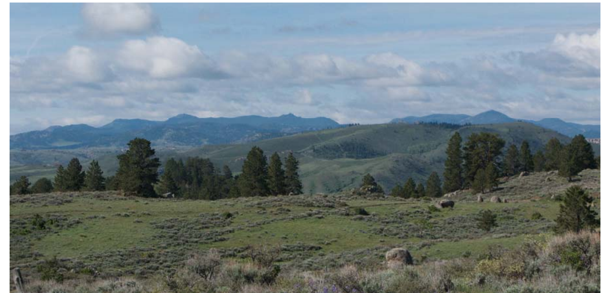
The Northern Laramie Range in Wyoming: Targeted for industrialization by the transmission and wind energy industries.

These two projects, if allowed to go forward, will alter fundamentally the character of a part of the County that many of us cherish as a place to live, ranch, hunt, fish or simply explore. The area has some of the finest scenery in the eastern part of Wyoming. It has undeveloped country roads winding through pine and aspen woods and over grand, open ridges with breathtaking views, en route to National Forest access points and campgrounds. It covers Wyoming Game & Fish's Elk Area 7, the richest in the state. It has old pioneer homesteads and many sites with prehistoric and more recent Indian artifacts.